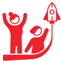
Incubators, Accelerators Mentors & Consultants